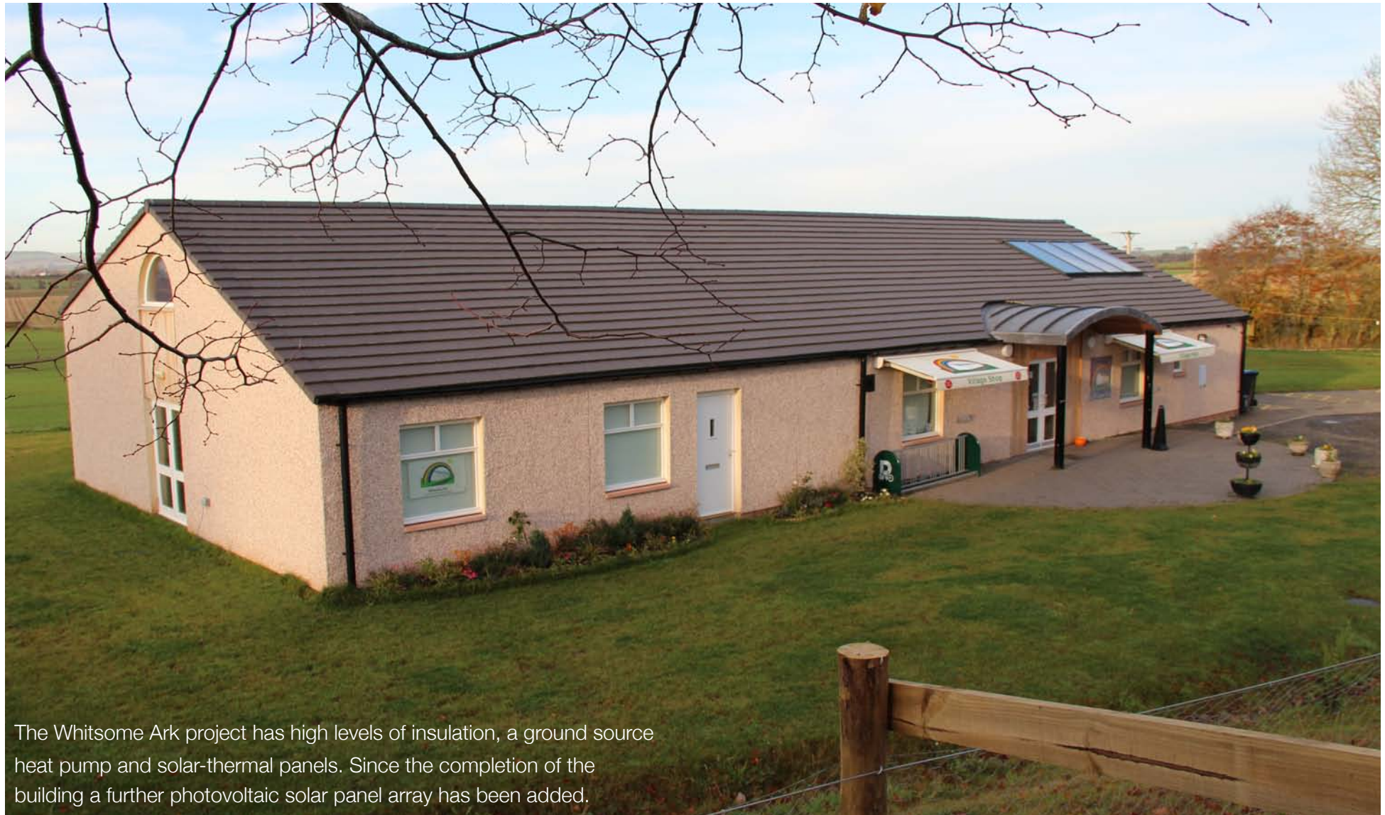
The Whitsome Ark project has high levels of insulation, a ground source heat pump and solar-thermal panels. Since the completion of the building a further photovoltaic solar panel array has been added.