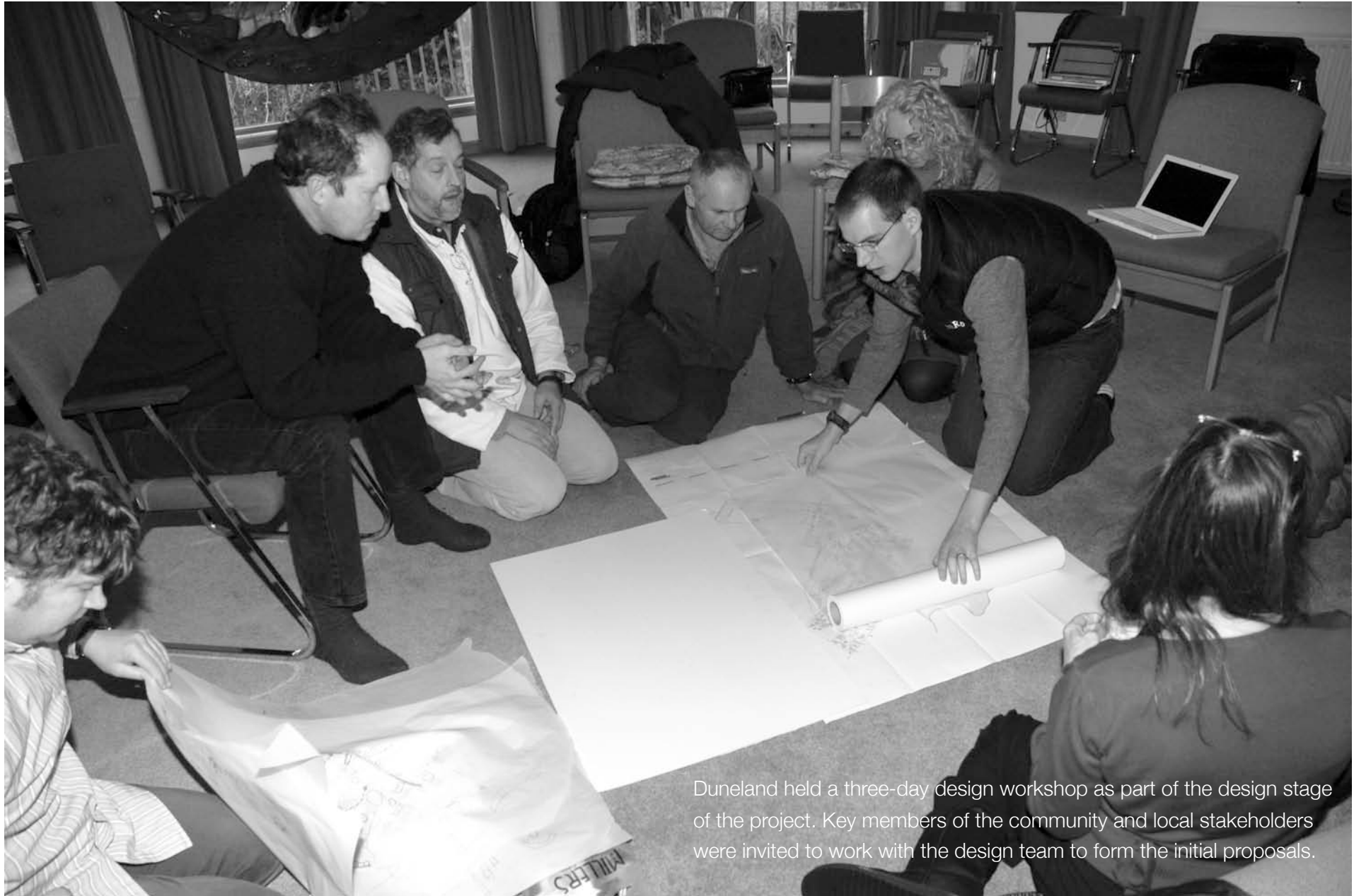
Duneland held a three-day design workshop as part of the design stage of the project. Key members of the community and local stakeholders were invited to work with the design team to form the initial proposals.