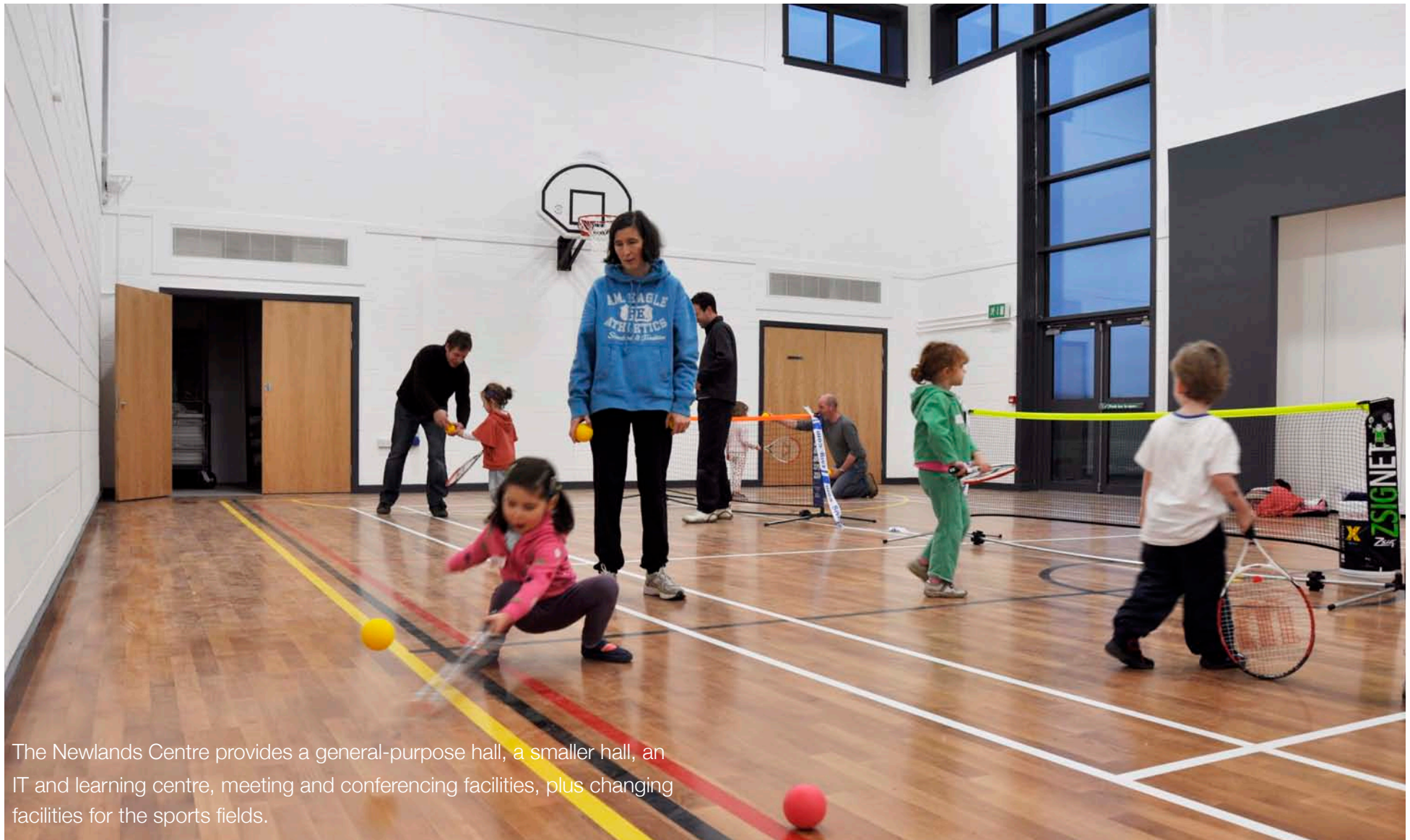
The Newlands Centre provides a general-purpose hall, a smaller hall, an IT and learning centre, meeting and conferencing facilities, plus changing facilities for the sports fields.