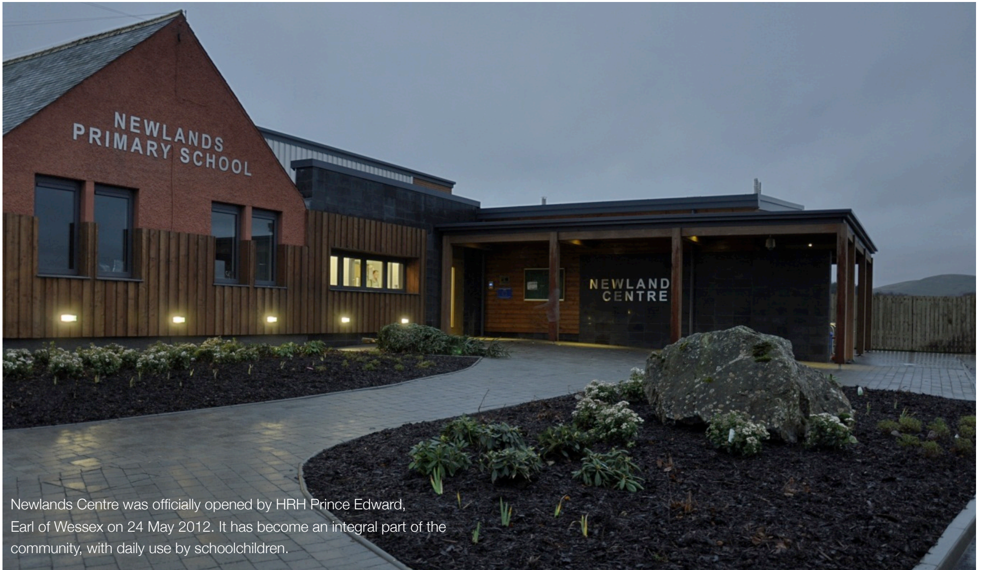
Newlands Centre was officially opened by HRH Prince Edward, Earl of Wessex on 24 May 2012. It has become an integral part of the community, with daily use by schoolchildren.