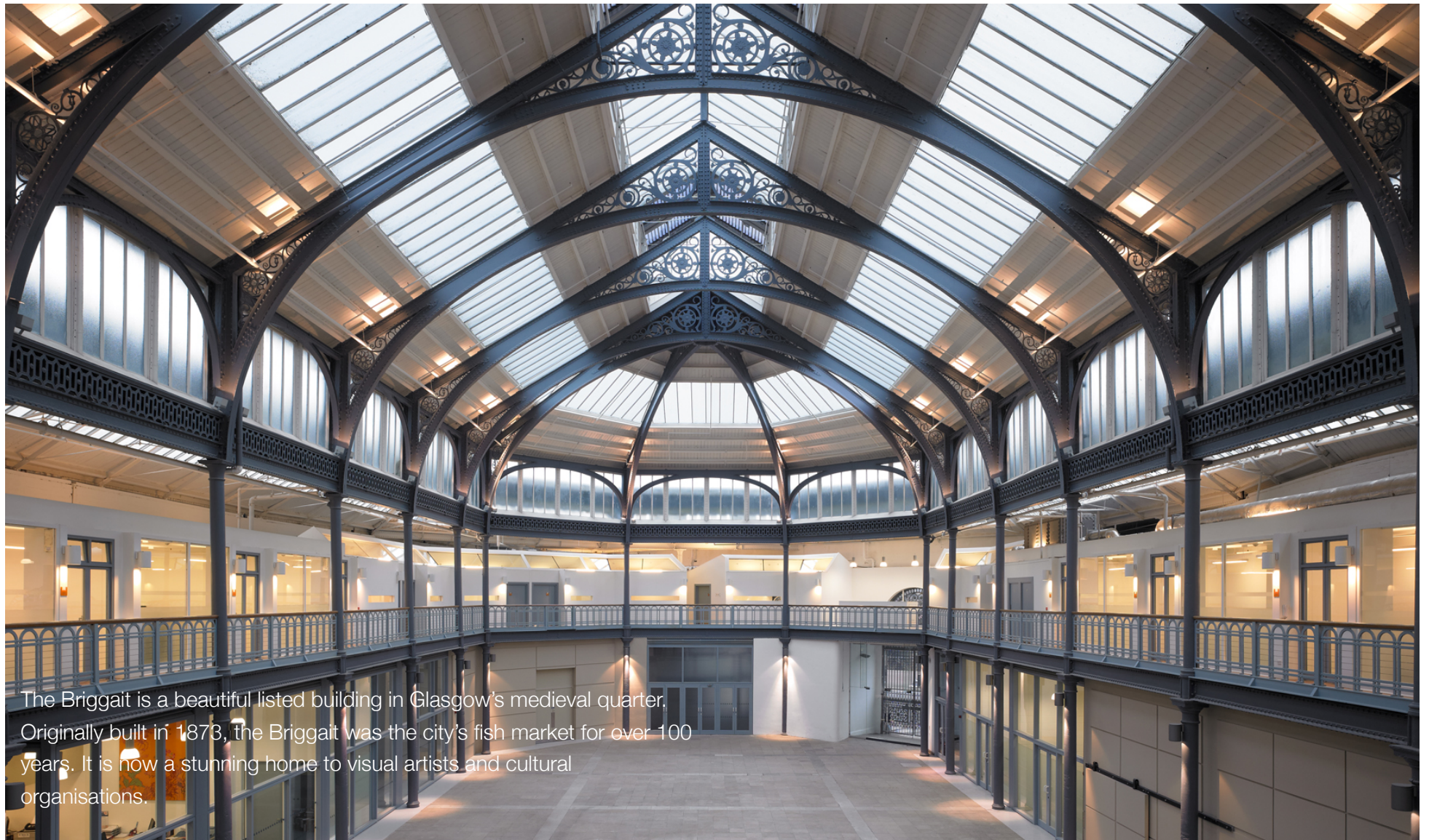
The Brigait is a beautiful listed building in Glasgow's medieval quarter. Originally built in 1873, the Brigait was the city's fish market for over 100 years. It is now a stunning home to visual artists and cultural organisations.